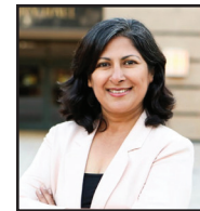
IRVINE MAYOR FARRAH KHAN

Huntington Beach, Garden Grove, Westminster, Fountain Valley, Cypress, Seal Beach, La Palma, Los Alamitos, Rossmoor, Midway City