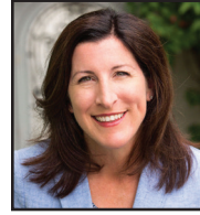
ASSEMBLYWOMAN COTTIE PETRIE NORRIS*

Seal Beach, Huntington Beach, Newport Beach, Laguna Beach, Aliso Viejo, Laguna Hills, Lake Forest, Laguna Woods