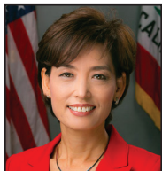
U.S. REPRESENTATIVE YOUNG KIM*