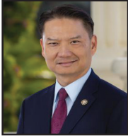
ASSEMBLYMAN TRI TA*